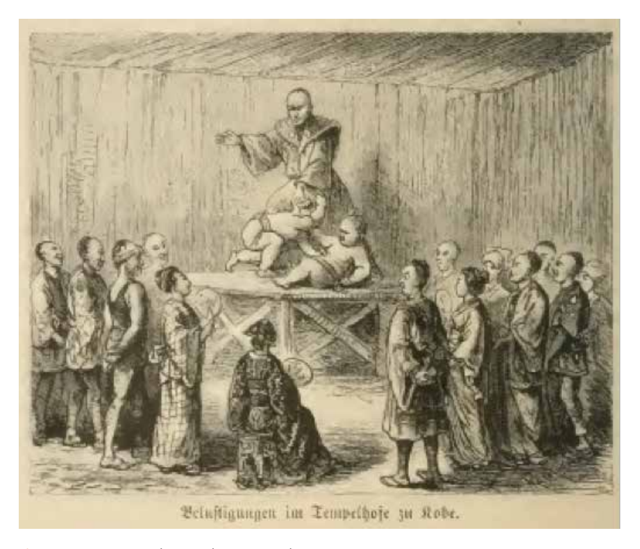
Fig. 2: Amusement in the Templepatio in Kobe.

Japan (e.g. Simonosaki [p.202]). Significant seems his style of comparison: he compares Japanese geography with European ones; for example the Japanese continental sea with the Bosporus or the rural area of Urima with the Steiermark (p.223). Furthermore, it indicates again the "Othering" of the Japanese. He is pointing out both differences but also many similarities to achieve familiarity for the reader (p.203). The author being Austrian-Hungarian does not seem to lose his focus on the topics of main interest to the European reader and provides supposedly hard facts about the development of the country: infrastructure, communication via telegraphs, modern ports and centers of business, agriculture, factories and, very detailed, the military and armory (pp.212-218). At times, Kreitner appears to provide scientific explanations or proof (p.224). Whether his sources are qualified and reliable and how he received the information remains unknown. Furthermore, he delivers dates for his travels and major destinations.