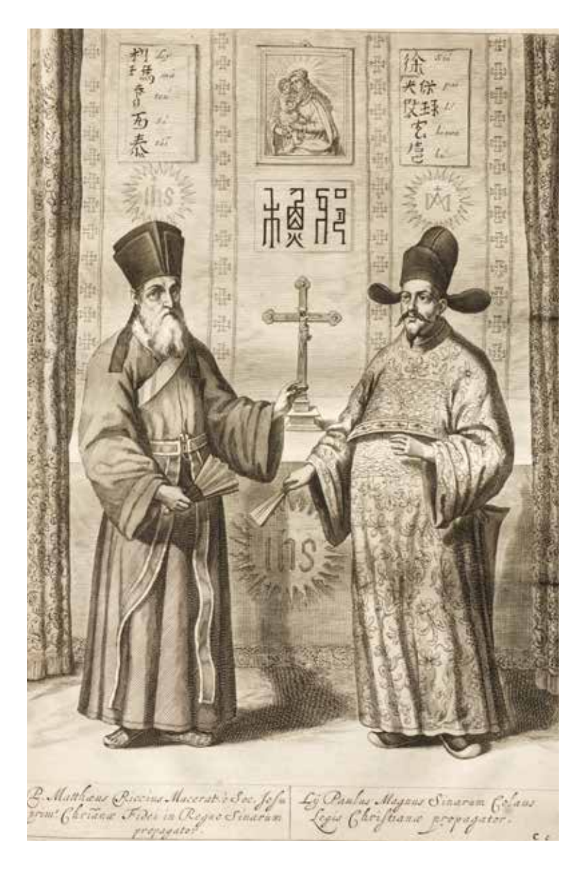
Source: Kircher, A. (1667). China monumentis, qua sacris qua profanis, nec non variis naturae & artis s pectaculis, aliarum que rerum memorabilium argumentis illustrata. Amsterdam: Jacobus à Meurs.