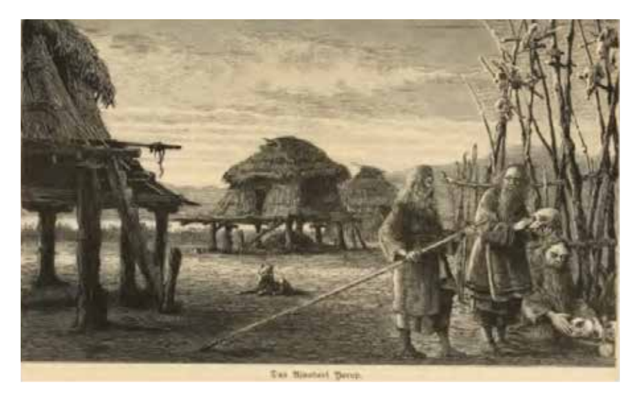
Fig. 4: The Aino village Yorop.

relying on information given by Japanese authorities (Watson, 1873, p.227). Holland, on the other hand, admits in 1874, that there is not only very limited knowledge about the Aino, but no numerical statistics, at all (Holland, 1874, pp.233-243). This represents a good example of provision of contradicting information in this time period. It can be assumed that because of the progress of technology and methodology regarding exploring unknown territory and its inhabitants, Kreitner's estimations might have been approximately correct at the time. In any case, he appears to be correct when pointing out the rapid decrease of the population numbers of the Aino regardless of detailed numbers.